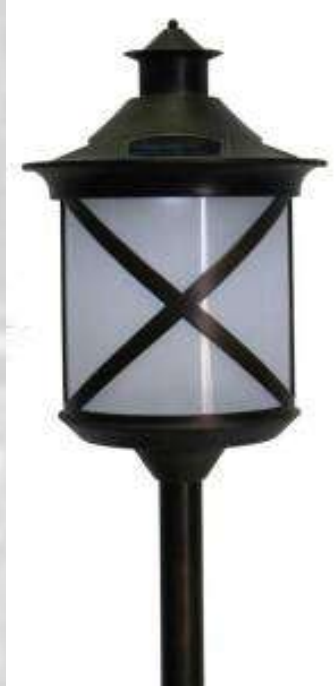
Model # 46207- 200PS