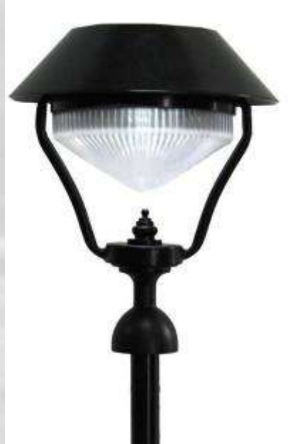
Model # 46205- 200PS