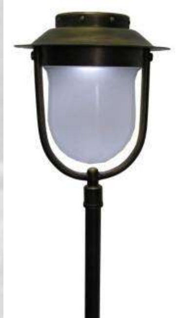
Model # 46209- 200PS